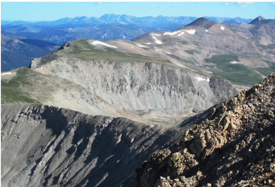
Great views from the summit.

Message:Rick's SPOT Check. We're going for Mt. Sherman 14er in South Park we're OK