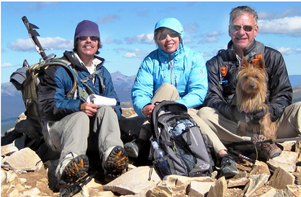
Summit Mt. Sherman, 14,036' at 9:50 am, 3 hours from trailhead.