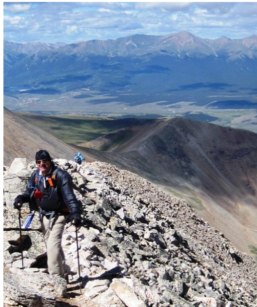
Navigating the Rocky Ridge